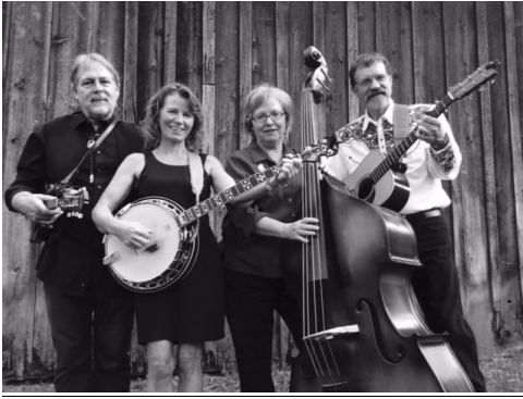
The OKSB at Shasta Historical Society Taste of History Event 2016